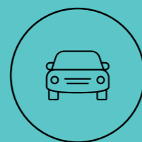
Mobile ANPR (LPR)

Enforcement Deputy™, is already being used by law enforcement agencies throughout Asia and the Middle East, providing safety and security with increased efficiency, while saving money and lives.