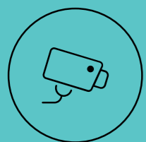
180-360 degree Video Surveillance

You can implement the basic surveillance application now, then expand its capabilities later by adding more advanced applications, such as ANPR or RoadMetric's unique traffic enforcement application, which processes recorded video/ audio data into evidence files and issue citations at a later date.